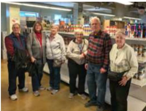
Daytimers enjoy a day of service at a food pantry for their February outing.